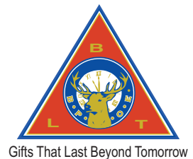
Gifts That Last Beyond Tomorrow